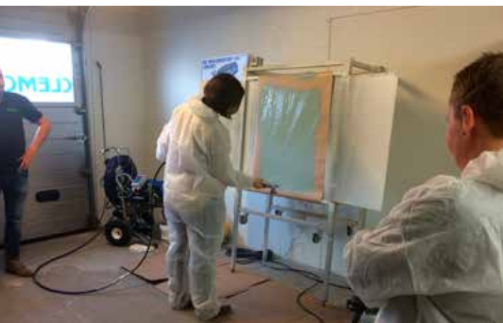
They also had a lot of fun trying out the UltraMax II 695