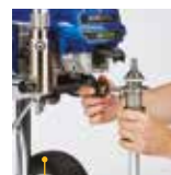
3 Remove the hose and suction set