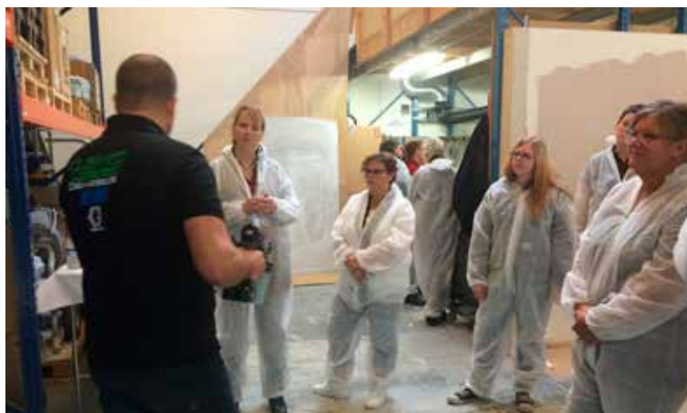
Graco distributor Clemco's staff lending a hand.