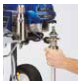
2 Open the cover and remove the pump