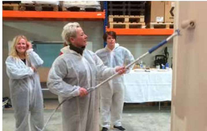
Demonstration day Attendees testing the JetRoller.

Graco distributor hosts a women-only demonstration