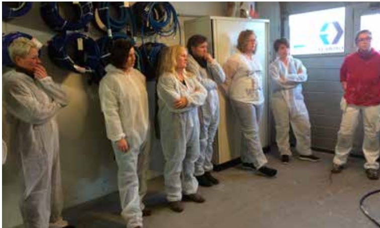
Forty female painters called on Rødovre in Denmark.